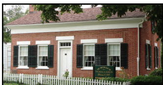
Thomas Edison's Birthplace

◇ YES, I AM JOINING YOU FOR THE THURSDAY TOUR (total # including family members _____)