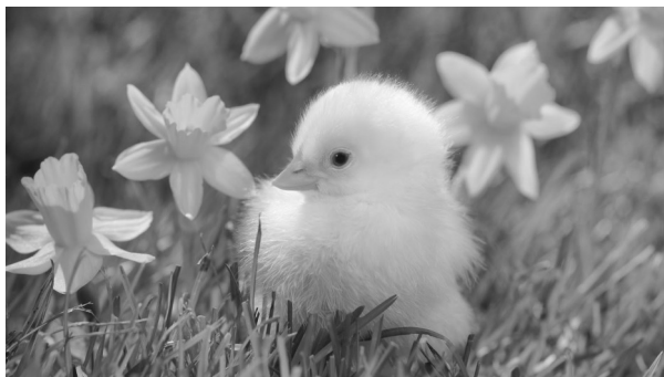
SPRING WILL BE HERE SOON!