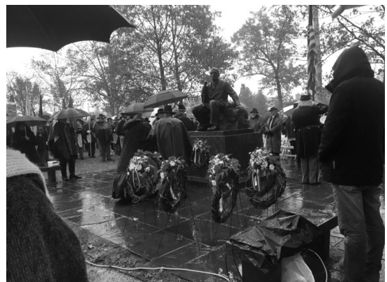
Dar Alcorn Places wreath at the Woolson Monument in Gettysburg National Cemetery Nov. 2017