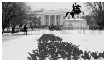
Winter in the East