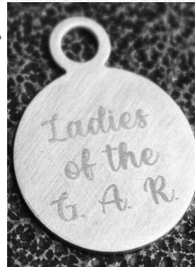
LGAR Charms $5.00