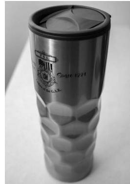
LGAR Tumbler Cup // Pets for Vets® $12.00