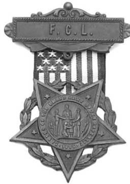
New Membership Badge $50.00