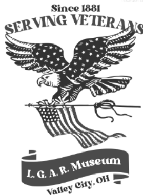
LGAR Museum SERVING VETERANS Shirt Pre- Order by 05/15 $25 + $8 SHIPPING